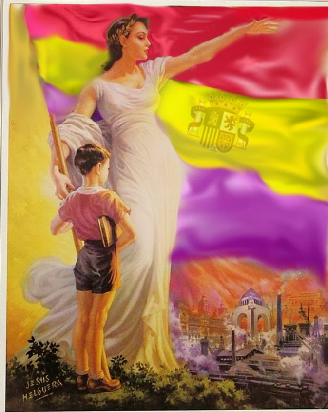
El Niño es la Mayor Promesa de la Patria